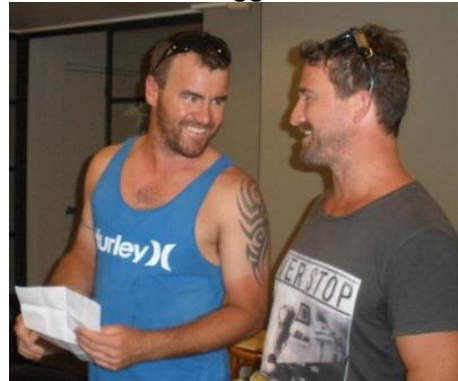
The two J's – our weigh masters share a