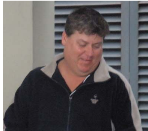
Sparrow again had the most