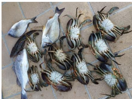
Nice days catch!

It is well documented that we won back the State of Origin trophy but that is not the only thing that went missing from up north!!!! The photos below from Mick & Barb show that these delicious offerings were high-jacked from the Banana benders!