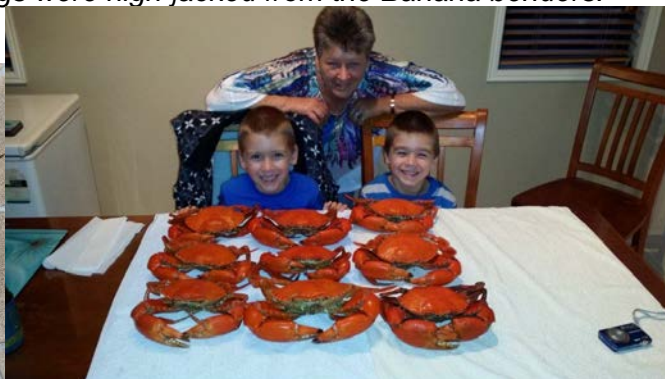
Nanny had to make sure the little ones didn't pinch any!