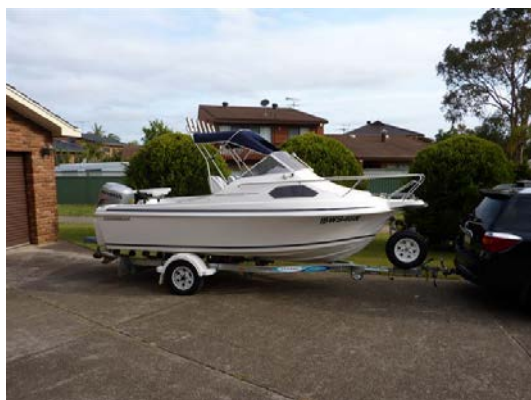
Carribbean Offshore Boat 4.88m