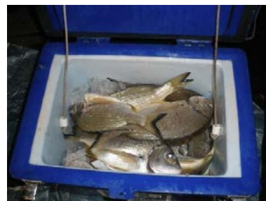
Some of this month's catch