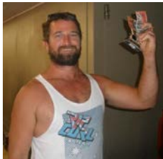
JB Best Fish & Mystery Fish winner