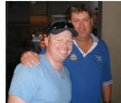
Sparrow had the most fish again