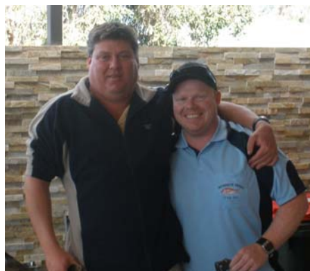
Sparrow, winner of biggest fish