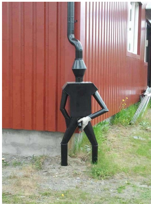
This is the COOLEST gutter downspout ever made!