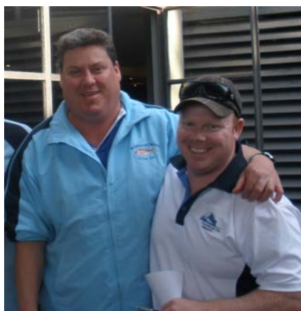
Sparrow had best fish for the weekend