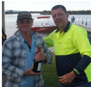
Gaz most fish winner