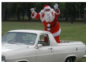
Santa arrive in a Holden Ute