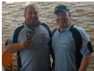
Plum had the most fish