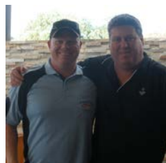
A Salmon wins Sparrow biggest fish