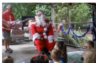
Santa hands out the presents.