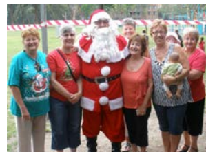
The Ladies & the annual Santa Photo.